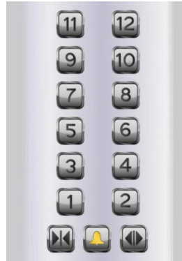
Figure 2 – Lift floor numbering which replicates the fire alarm panel floor numbering