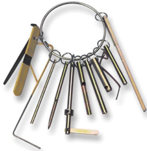
Figure 4 – Lift emergency door keys