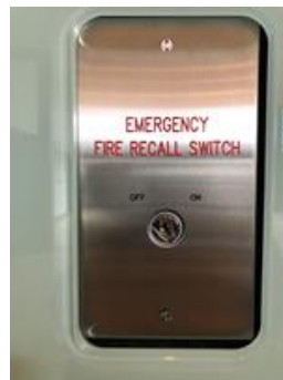
Figure 1 – Firefighter control recall switch