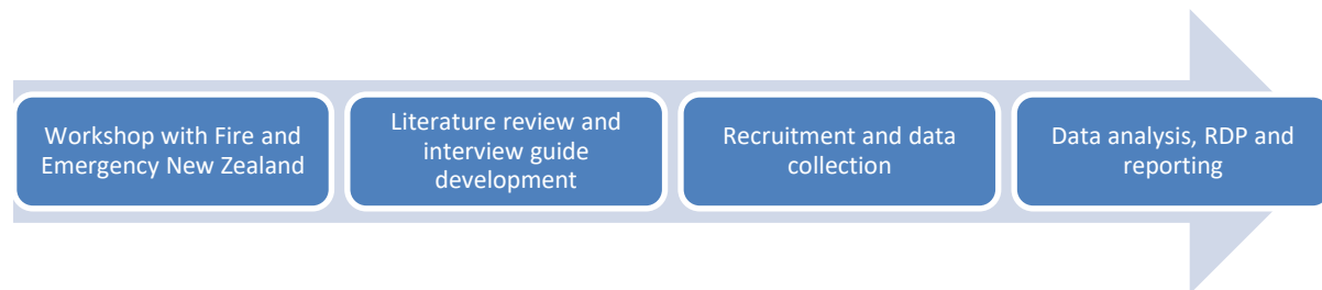
Figure 1: Research steps

The research consisted of four key steps (see Figure 1):